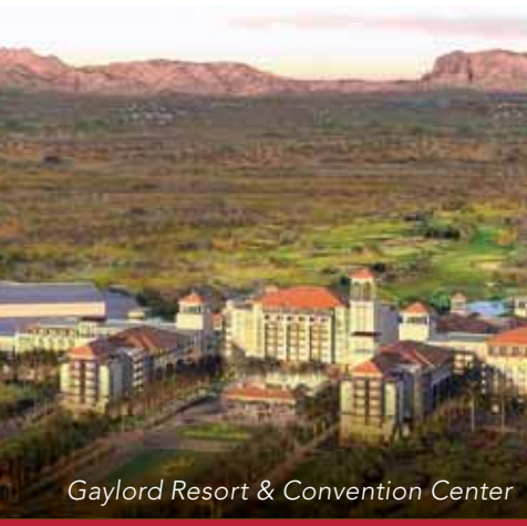
Gaylord Resort & Convention Center

Recently announced, the Gaylord Resort & Convention Center will be built in Mesa adjacent to Phx-Mesa Gateway Airport and will serve as a signature economic development project for the entire state. The plan calls for 1,200 rooms and a 500,000 sq. ft. convention center, 20,000+ sq. ft. spa, Tom Fazio-designed 18-hole golf course and more. Gaylord Hotels is a pioneer in the hotel and convention industry with a collection of upscale, meeting-focused resorts in Tennessee, Florida, Texas, and Washington, D.C.